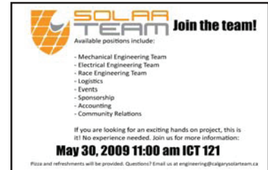
Properly sized artwork example