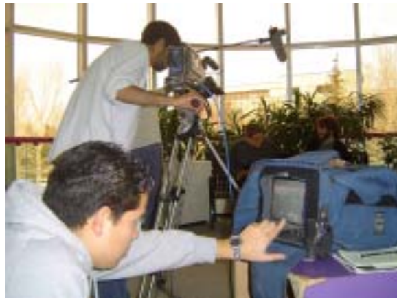
FILM SCHOOL Congratulations to all our 2005 Film School Participants