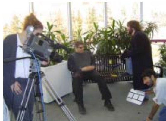
the photos above and below show production

ALL MEMBERS PAST AND PRESENT are invited to NUTV's ANNUAL CHRISTMAS PARTY Saturday 26 November 6:30PM The Auburn Saloon